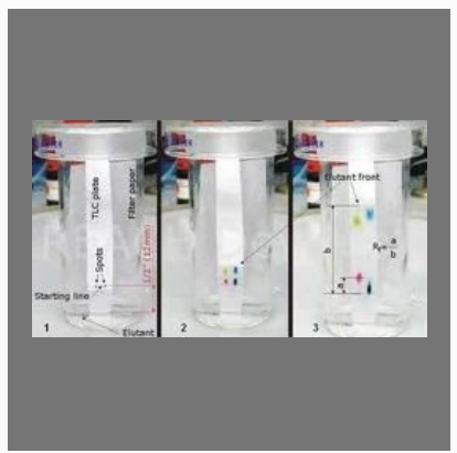
Hplc and Hptlc Analysis