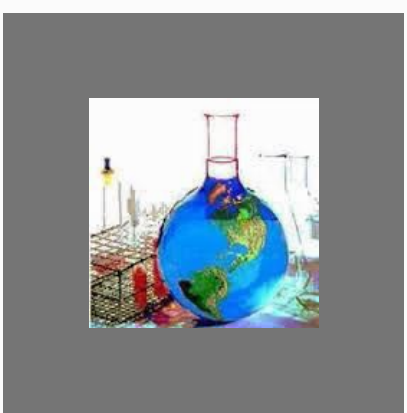
Dyestuffs Chemical Testing