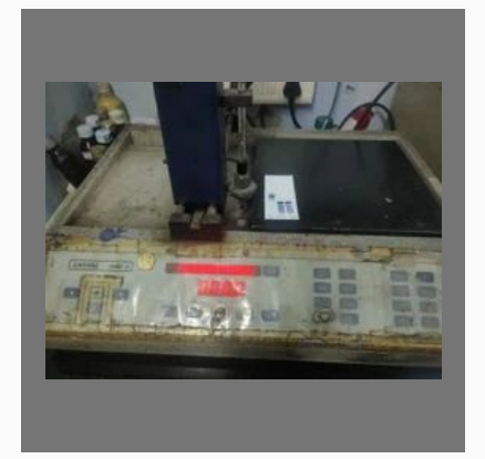
TLC applicator Linomate IV