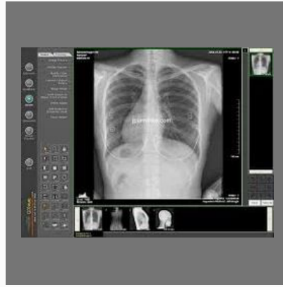
Digital Xray Services