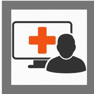
Doctor Medical Facilities Services