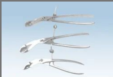
Self Centring Forcep