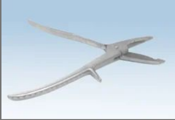
Wire Cutter Cum Bender Cum Plier