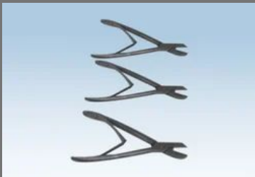
Bone Cutter Single Action