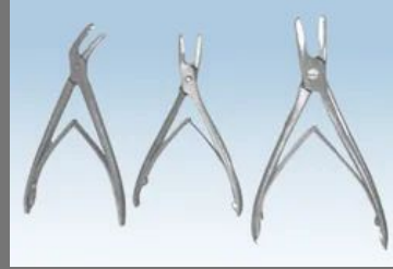
Bone Nibbler Single Action