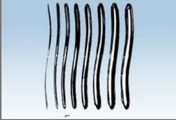
Hegger Dialator Set