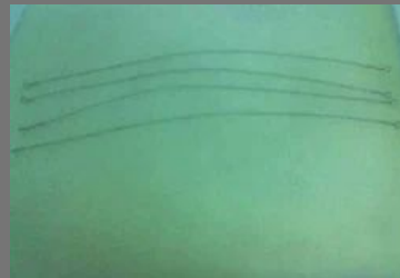
Gigly Saw Wire