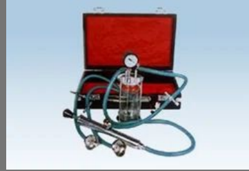
Vacuum Extractor Set