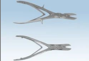
Bone Cutter Double Action