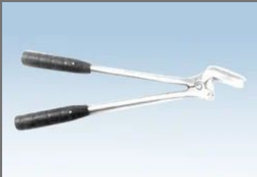
Plaster Shear Stilly