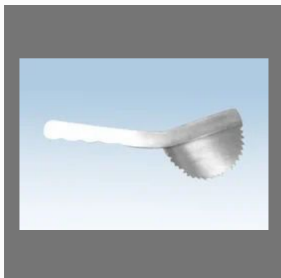
Plaster Saw Heavy Handle