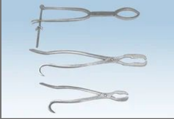
Bone Holding Forceps