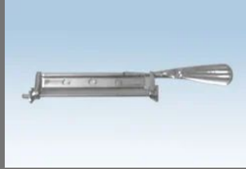
Skin Grafting Handle (humbis Knife)