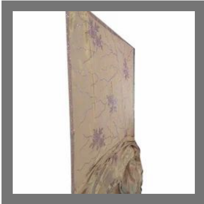
Swarovski Crystal Work Sarees