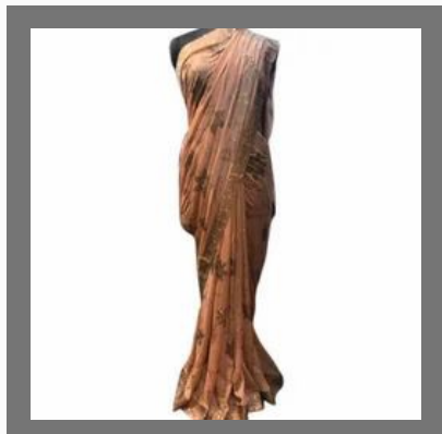
Swarovski Stone Work Sarees