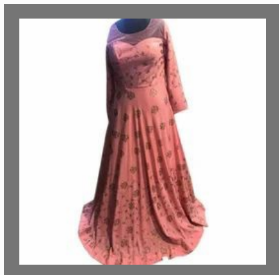
Swarovski Beaded Stone Gown