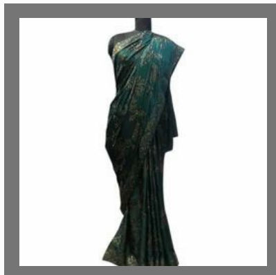
Swarovski Crystal Work Sarees