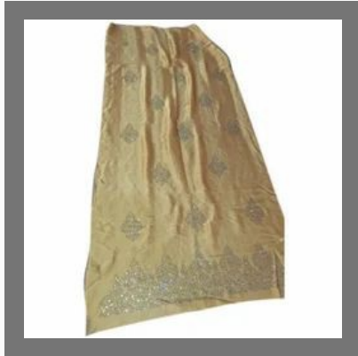
Swarovski Stone Saree