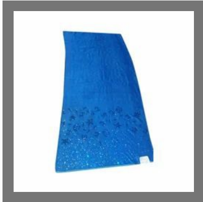
Swarovski Crystal Work Sarees