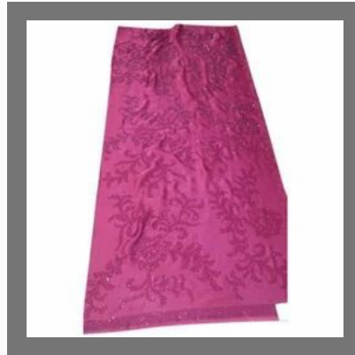
Swarovski Stone Saree