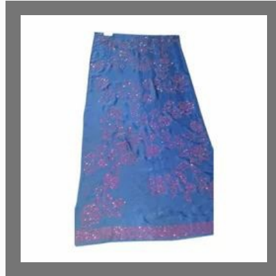
Swarovski Crystal Work Sarees