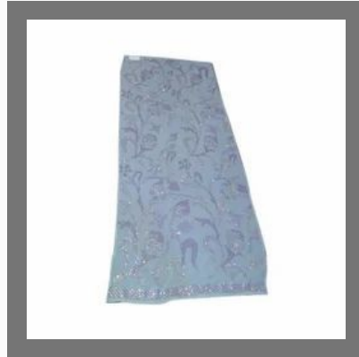
Swarovski Crystal Saree