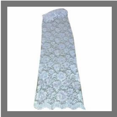
White Swarovski Stone Saree