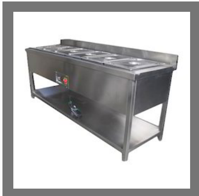
Bain Marie Hot Case