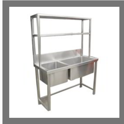
Two Sink Unit