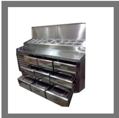
Make Line Refrigerator