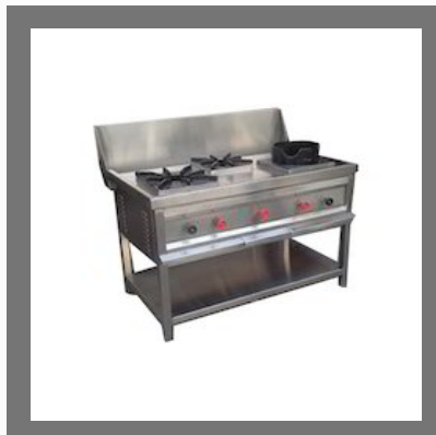
Oriental Gas Range