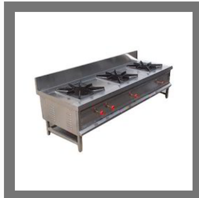
Bulk Cooking Range