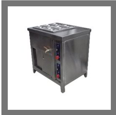
Bain Marie Cum Hot Case