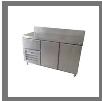
Work Top Refrigerator