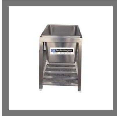
SS Hotel Sink Unit