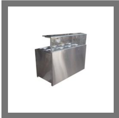
Display Bain Marie Counter