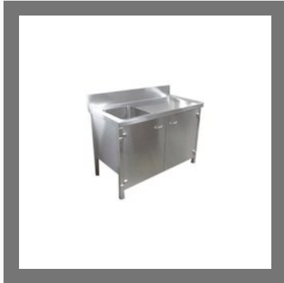
Sink Table Unit