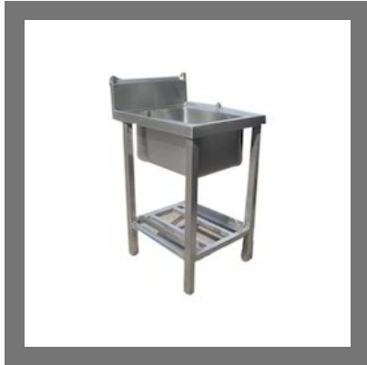
Commercial Sink Unit