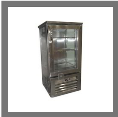
Refrigerated Pastry Display Counter