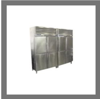
4 Door Vertical Refrigerator