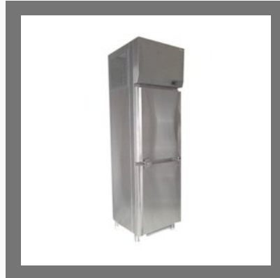
2 Door Vertical Refrigerator