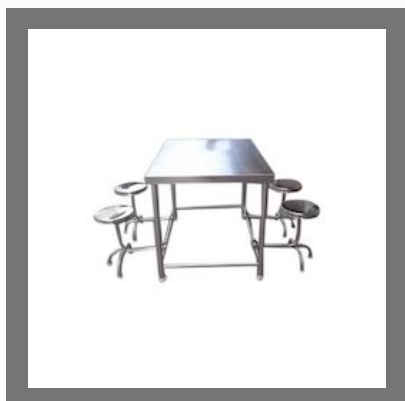
Cafeteria Dining Table