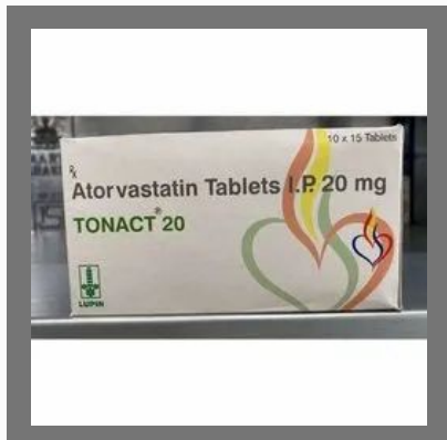
Atorvastatin Tablets Ip 20 Mg