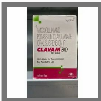
Amoxicillin And Potassium Clavulanate Oral Suspension