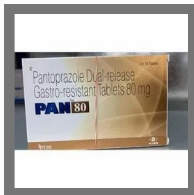
Pantoprazole Gastro Resistant Capsules