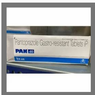
Pantoprazole Gastro Resistant Capsules