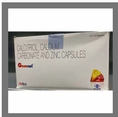
Calcitriol Calcium Carbonate Zinc Tablet