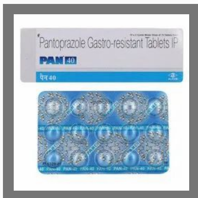
Pan 40 Mg Tab