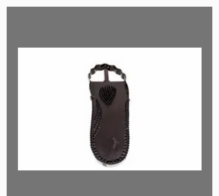
Leather Shoe Clicking Die