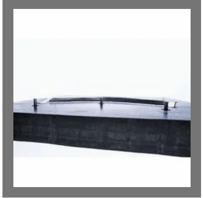
CNC Milled Die