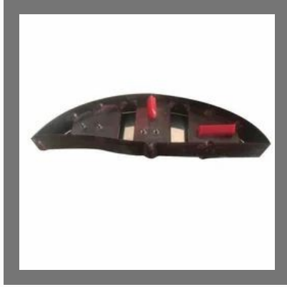
Leather Sheet Cutting Die