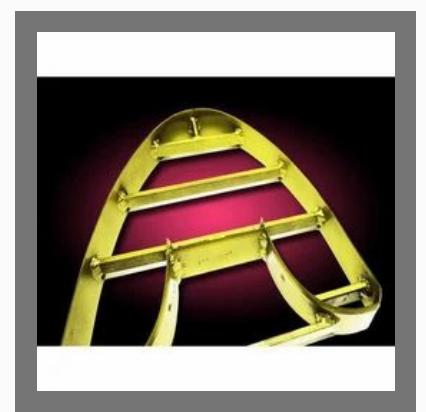
Leather Clicking Die