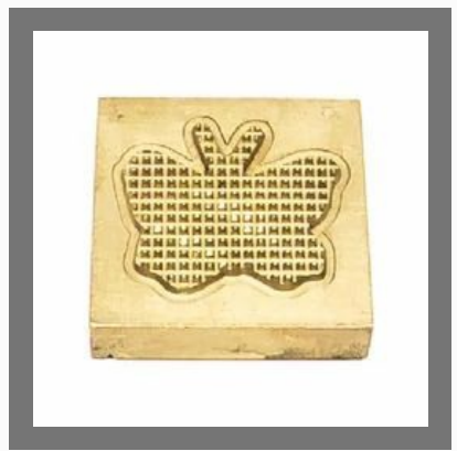
Leather Embossing Die