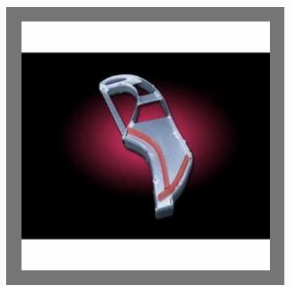
Footwear Clicking Die