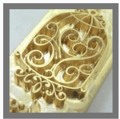
Brass Embossing Die