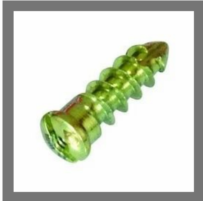
Tit Bone Screw