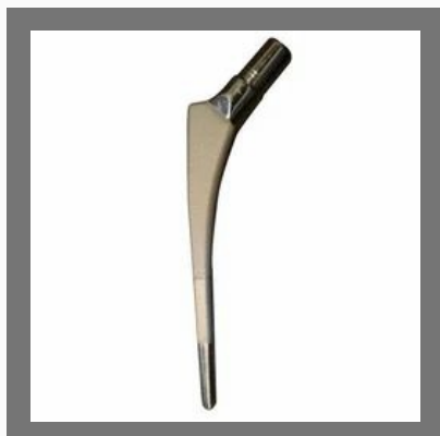
HA Coating Modular Stem