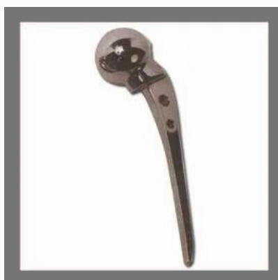
Austin Moore Prosthesis