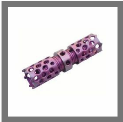
Tit Spinal Implant