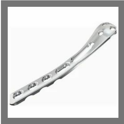
Long Locking Plate