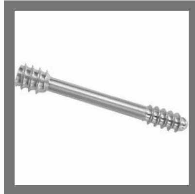
Tit Herbert Screws