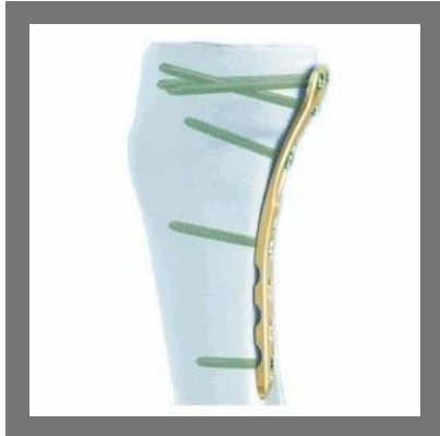
Locking Proximal Tibia Plate