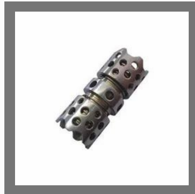
SS Spinal Implant