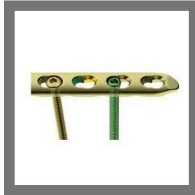
Locking Compression Plate