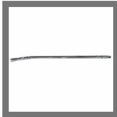
SS Intramedullary Nails