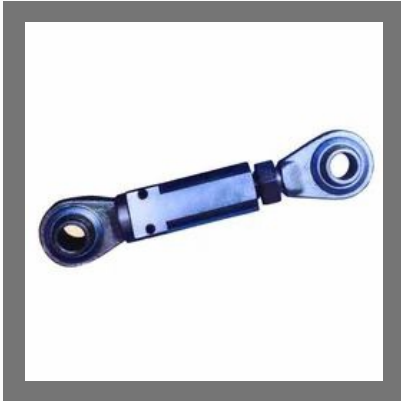
SS Turn Buckle