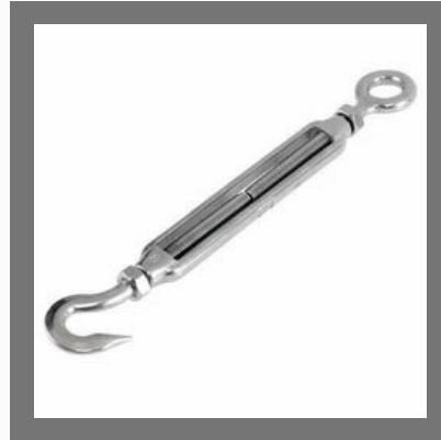
Rod End Turn Buckle