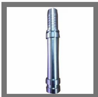
CNC Machined Pin