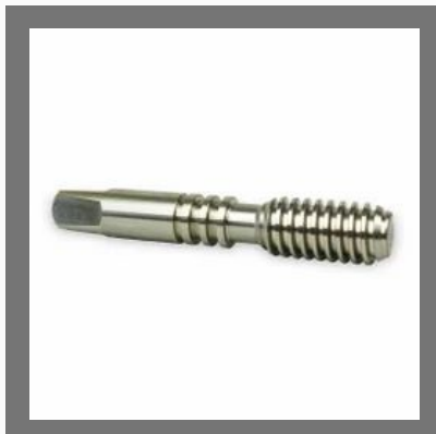
Precision Turned Cone