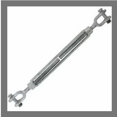
MS Turn Buckle