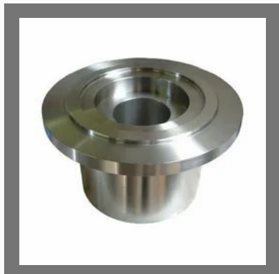
Special Turned Flange