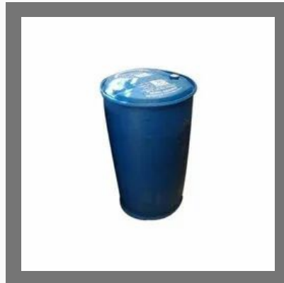
Liquid Sorbitol 70% IP