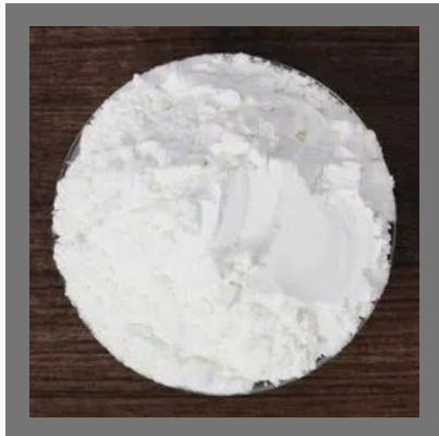
Maize Starch Powder