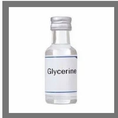
Refined Glycerine CP, IP