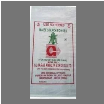
Maize Starch Ip Grade