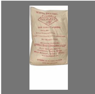
White Dextrin Powder