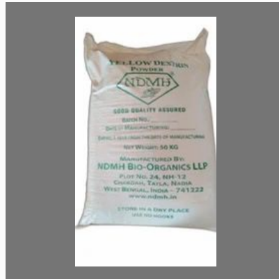
Yellow Dextrin Powder