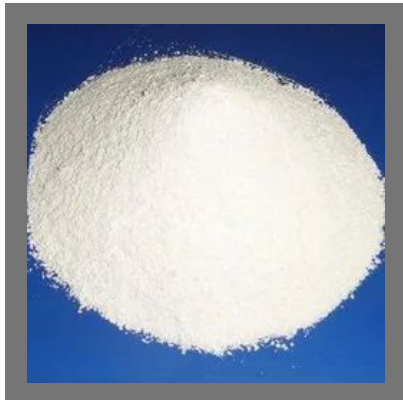
Soda Ash Light