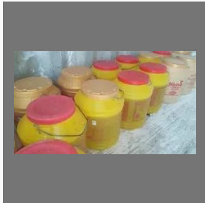
Corn syrup Liquid Glucose small pack