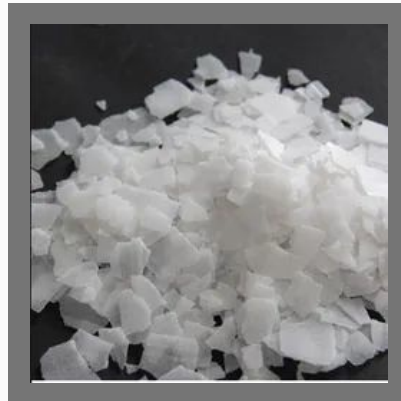
Caustic Soda Flakes