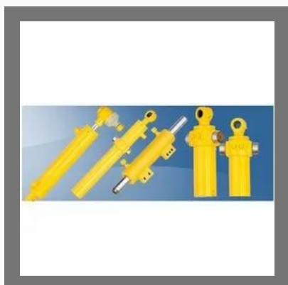
Dantal 200 Mm Hydraulic Cylinder