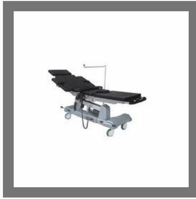
Dantal OT Table