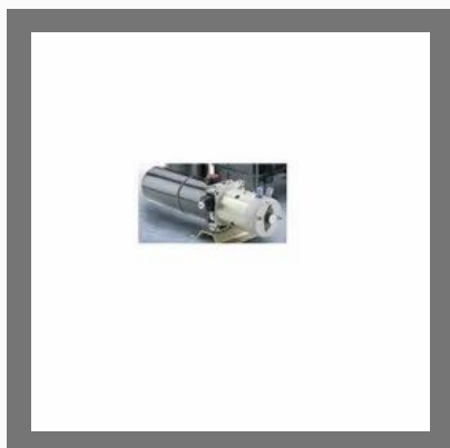
Dantal 4x2 Car Carrier