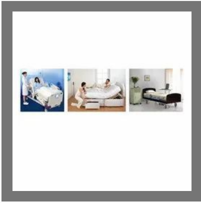
Dantal Electrical Beds