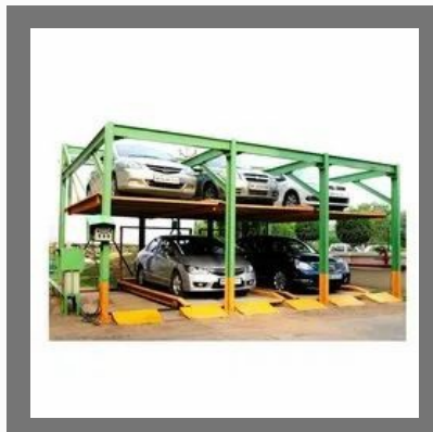
Dantal 0.4 KW Puzzle Type or Semi-Automatic Car Parking System