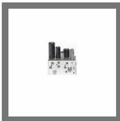
Dantal Manifold Block Assembly Hydra Force