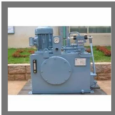
Dantal 5000 Psi Hydraulic System