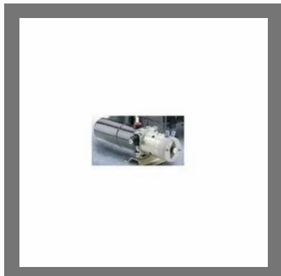
Dantal AC/DC Mini Power Units