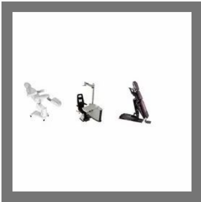
Dental Chair Units