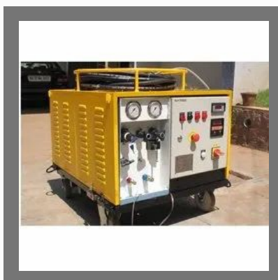
Dantal 350 Bar Aircraft Hydraulic Service Trolley