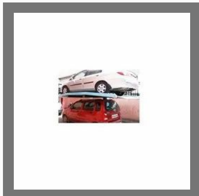
Dantal 2000 kg Dependent or Stack Car Parking System