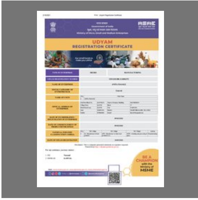
Msme Udyog Aadhaar Registration