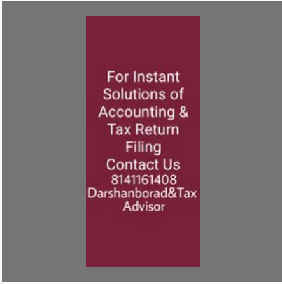
IT Tax Return