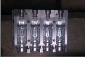
Juice Bottle Mold