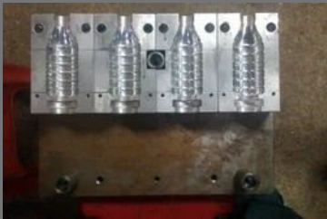
4 Cavity Blow Mould