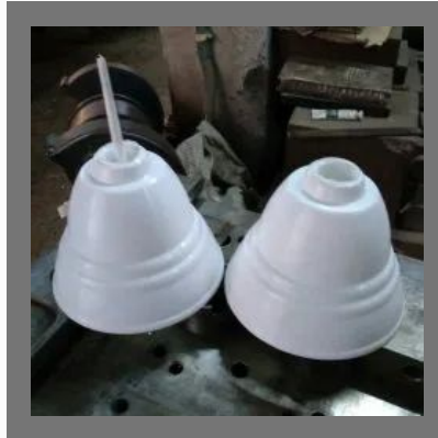
Fan Canopy Mould