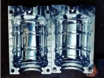
Single Cavity PET Blow Mould 20 Ltr