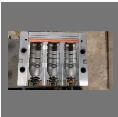
Juice Mould 3 Cavity