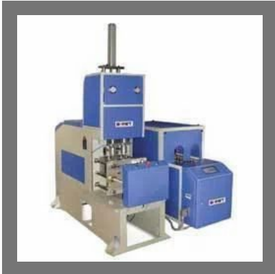
PET Stretch Blow Molding Machine