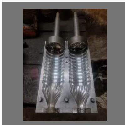
Mustard oil 1 Ltr Bottle Mould