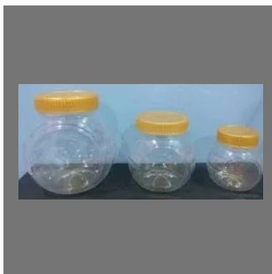
Plastic PET Jar DIE