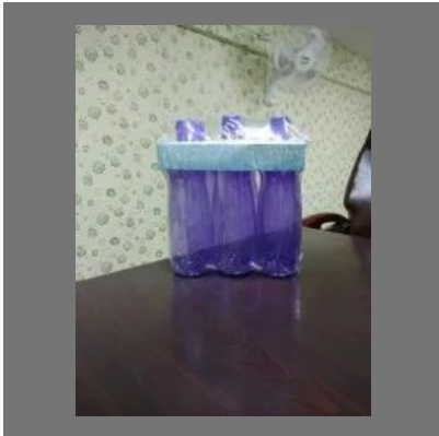
Plastic Water Bottle 1 Ltr