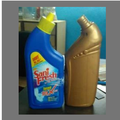
Toilet Cleaner Bottles