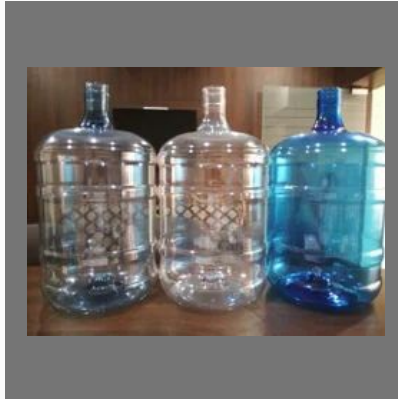
PET Water Jar Mould 20 Ltr