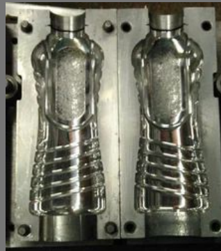
PET Fridge Bottles Moulds