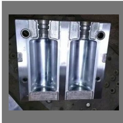
HDPE Bottle Blow Mould 500 ML