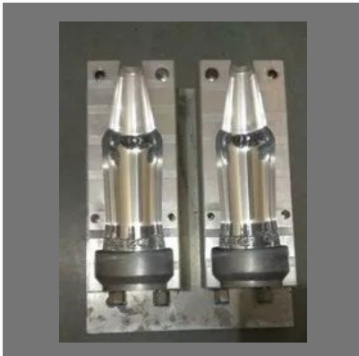
Plastic Single Cavity Soda Nut Mould