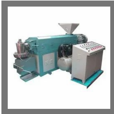
Blow Molding Machines