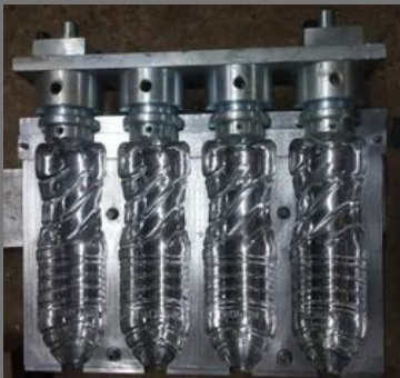
Fully Automatic PET Blow Mould