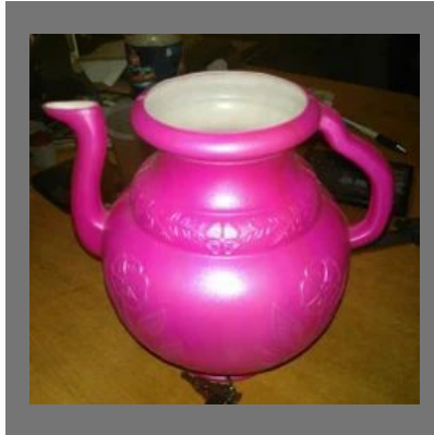
Details Double Color Tea Pot Mould