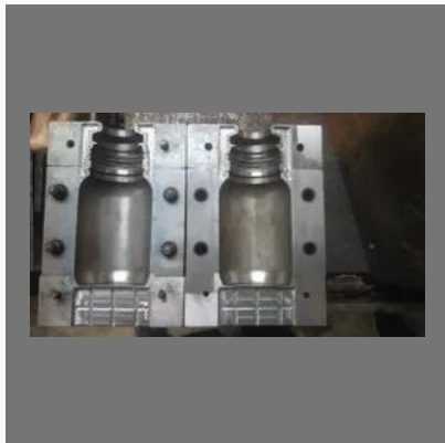
HDPE Blow Mould 200 ML