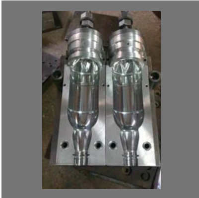
600ml Soda Bottle Moulds