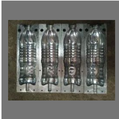
Four Cavity Water Bottle Mould 1 Ltr