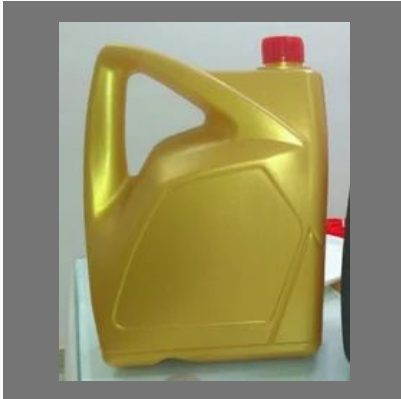
Engine Oil Bottle Moulds