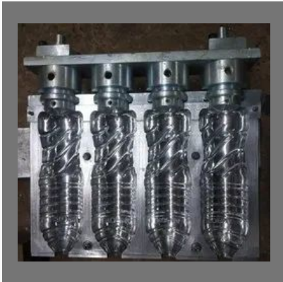
Plastic Water Bottle Mould 1 Ltr