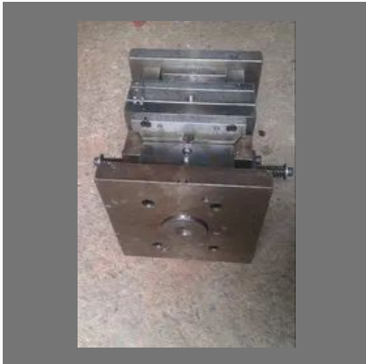
Plastic Cap Injection Molding