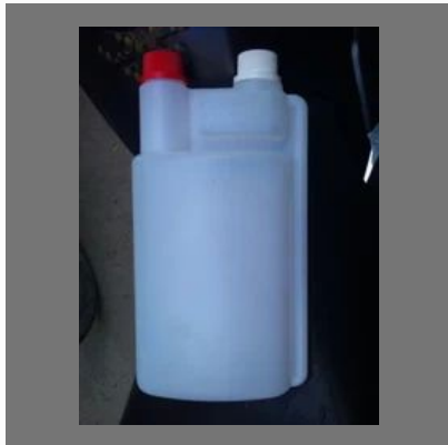
HDPE Blow Mold For Fuel Booster