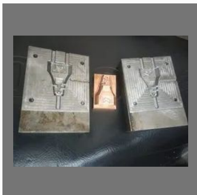
2 Pin Plug Hand Mould