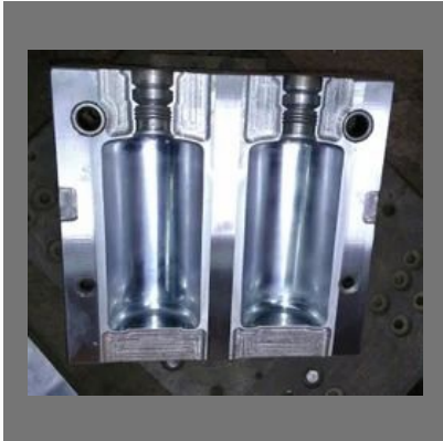
500ml HDPE Round Bottle Mould 2 Cavity