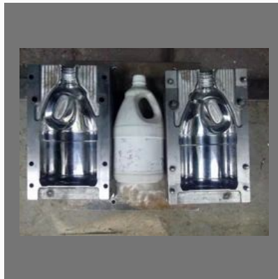
HDPE Plastic Can Mould 2 Ltr