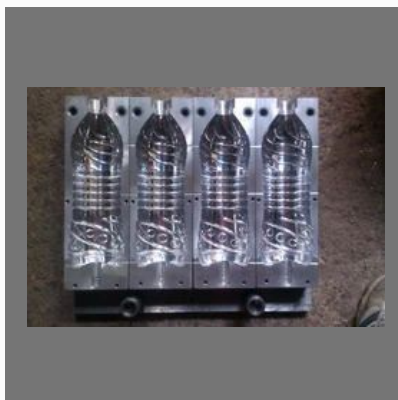
4 Cavity Blow Mould