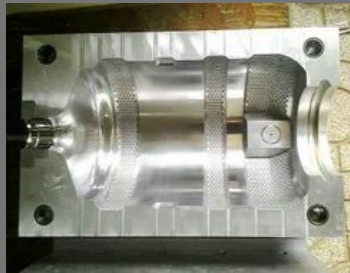
20 Ltr Water Jar Mold