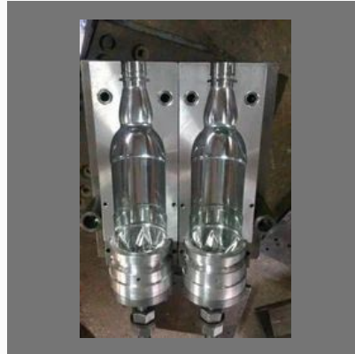
500 MI Soda Bottle Mould