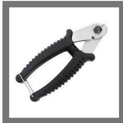
Professional Cable Cutter