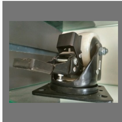
Break Castor Wheel