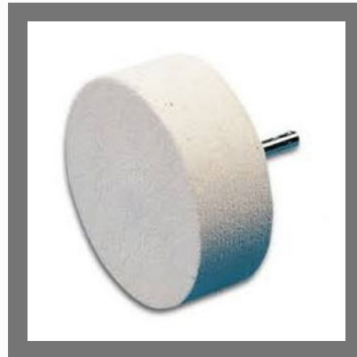
Felt Buffing Wheel