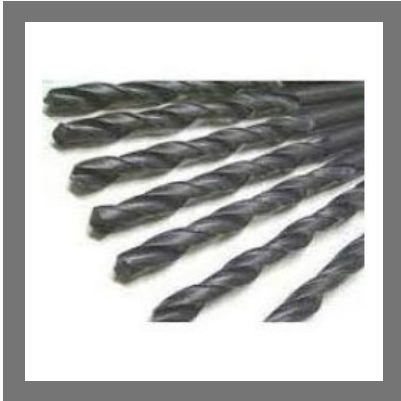
Parallel Shank Twist Drill