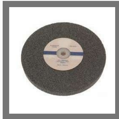
Brown Aluminum Oxide Wheel