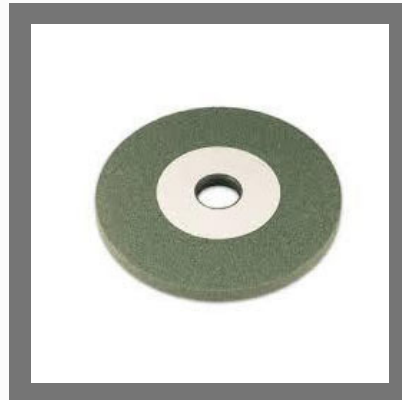
Green Carbide Wheel