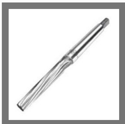
Machine Reamer with Taper Shank