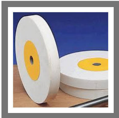
Oxide White Wheel