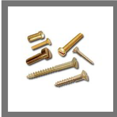
Brass MS Screw