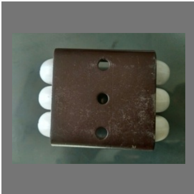
Six In One Castor Wheel