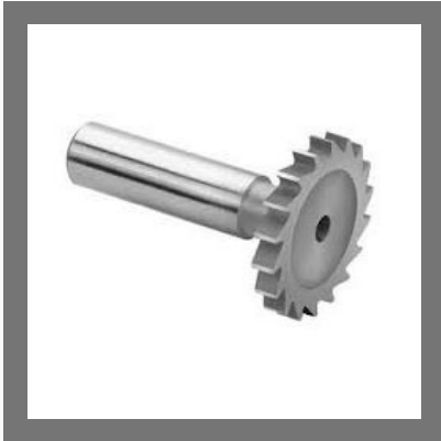
T Slot Cutter