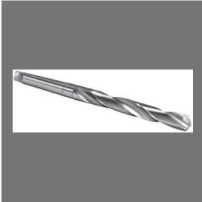
Taper Shank Twist Drill