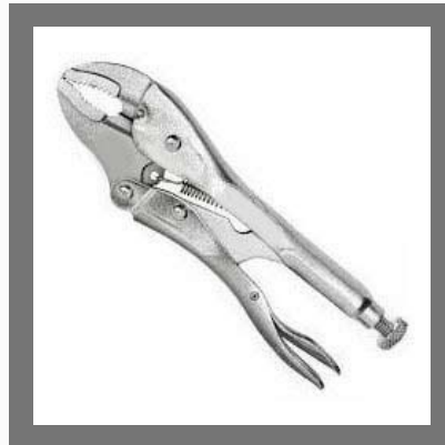
Vice Grip Plier