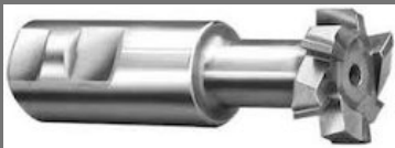
T Slot Cutters With Taper Shank