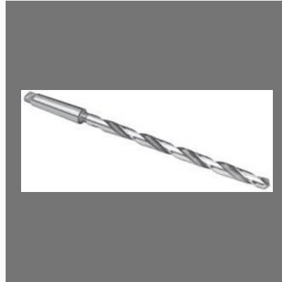
Taper Shank Twist Drill