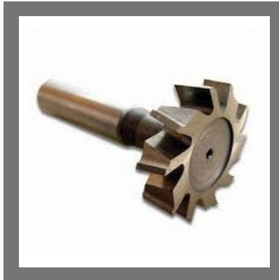
T Slot Cutters With Parallel Shank