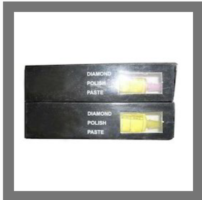
Diamond Polish Paste