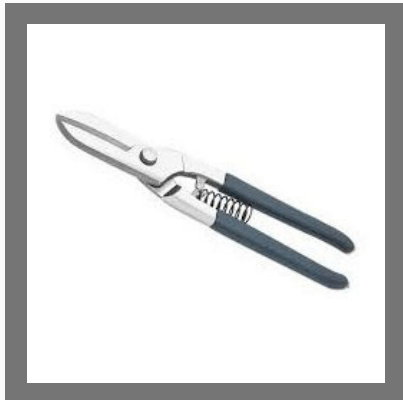
Tin Cutter With Spring