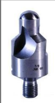
Countersink With Taper Shank