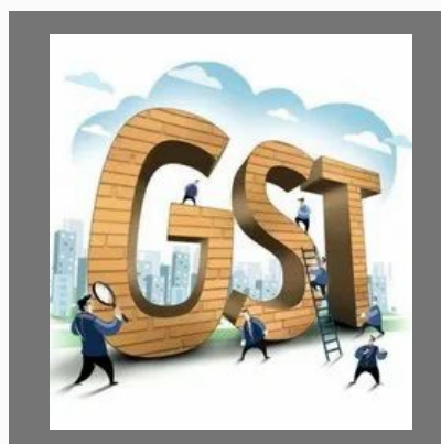
Gst Consultancy Service