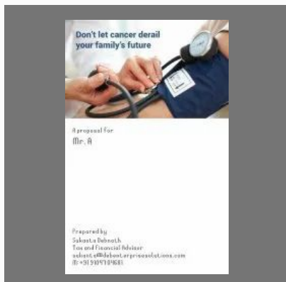
LIC Cancer Plan Service