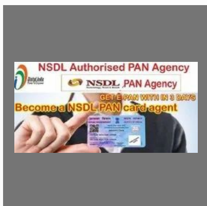
NSDL TIN-FC Pan Card Centre