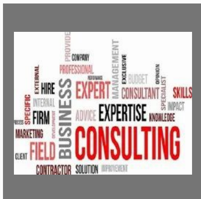
PF and ESI Consultant