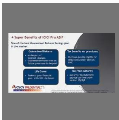
ICICI Prudential Term Deposit Scheme