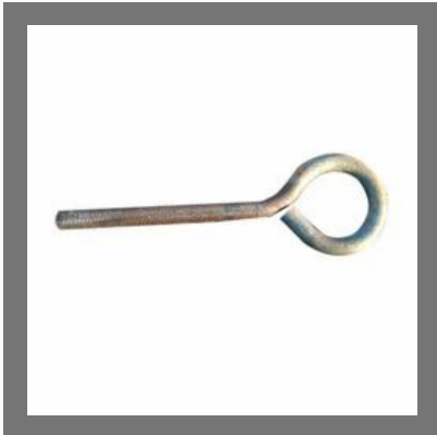
MS Eye Bolt