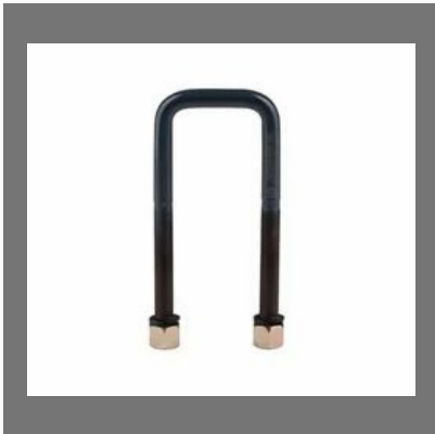
Square U Bolts