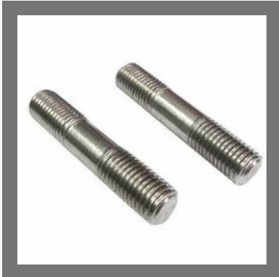
Half Thread Stud Bolt B1 B2 TYPES SS MS B7 8.8