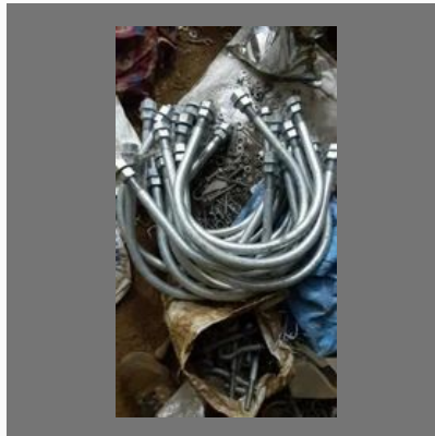
Anchor Bolts Foundation Bolts