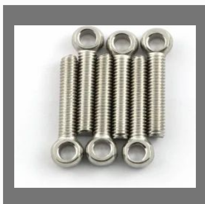
PIN TYPE EYE BOLTS