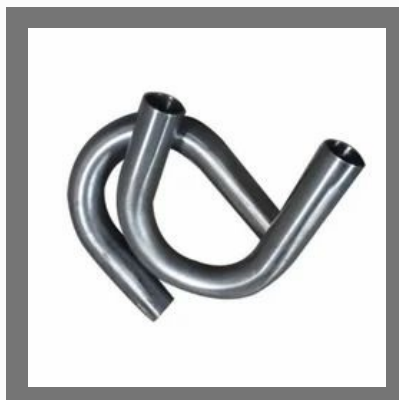
U Tube Bend Rods