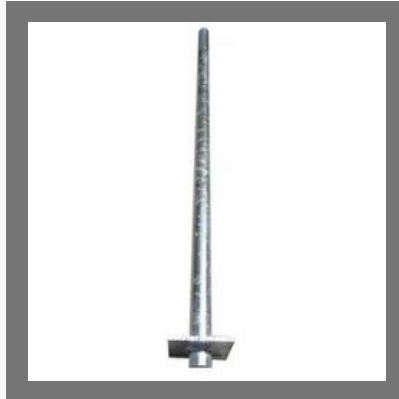
ms Foundation Bolt