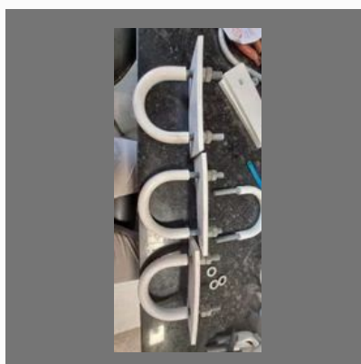
U BOLT WITH RUBBER SLEEVE PLATES