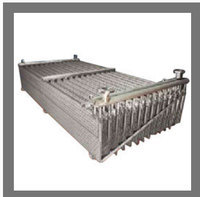
Econo coil Heat Exchanger