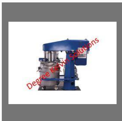
High Speed Dispenser