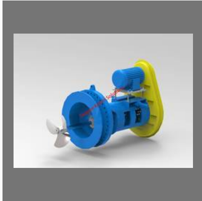
Side Entry Mixer