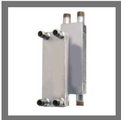
Maxchanger Heat Exchanger