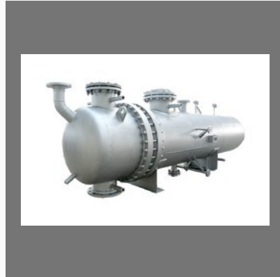
Shell Tube Heat Exchanger