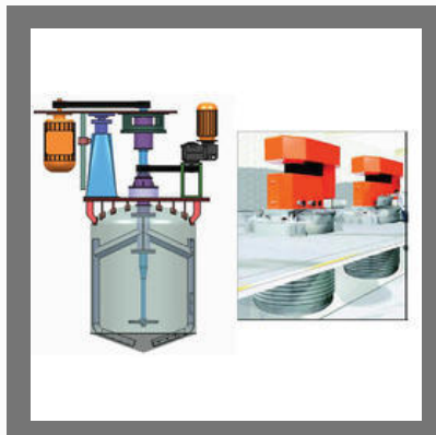
Twin Shaft Dispenser