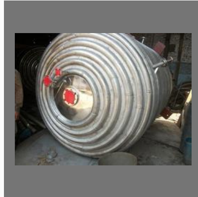
Limpet Coil Vessel