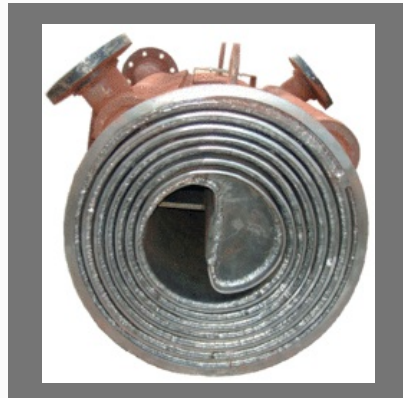
Spiral Heat Exchanger