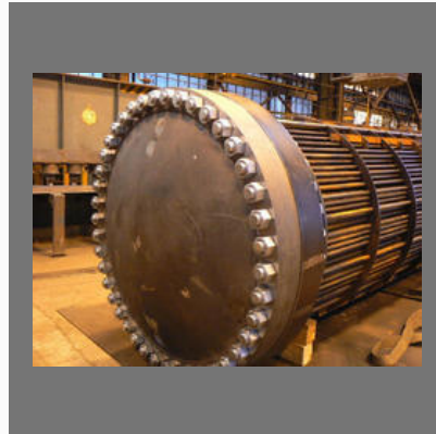
Heat Exchangers Maintenance