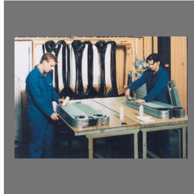
Heat Exchanger Service and Spare Parts