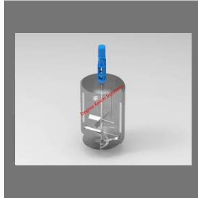
Top Entry Mixer