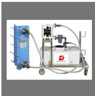
Clean In Place Machine