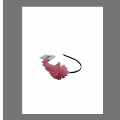
Light Peach Hair Band