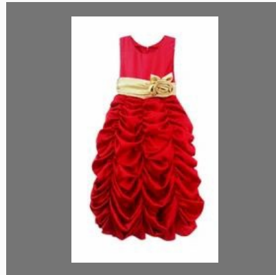
Red with Golden Belt Gown