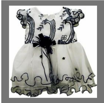
Girls Party Wear