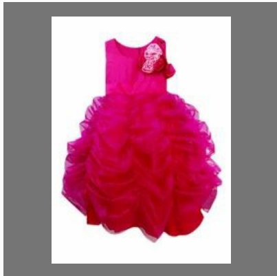
Party Wear Ball Gowns