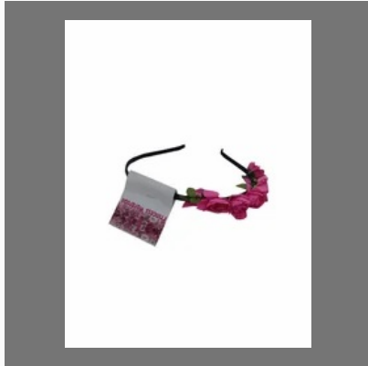
Pink Hair Band