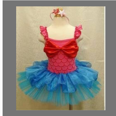
Girls Party Wear Frocks