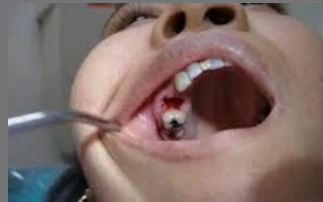
Minor Dental Surgeries