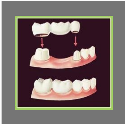
Crowns And Bridges