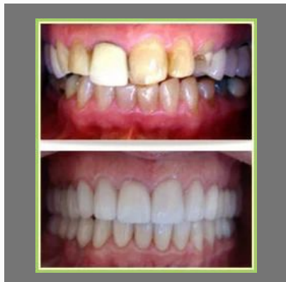
Smile Correction And Full Mouth Correction