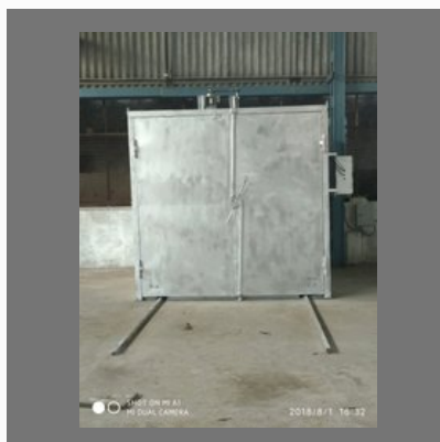
Industrial Heating Oven 0 to 100 Degrees