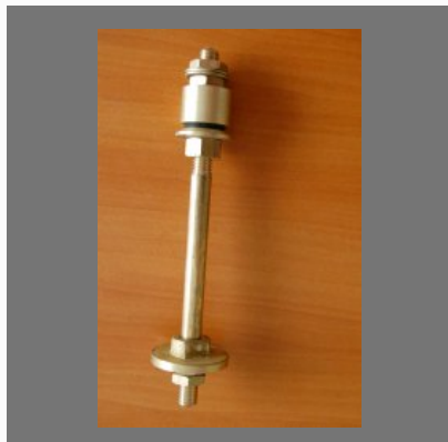
LV Metal Part 250 AMPS