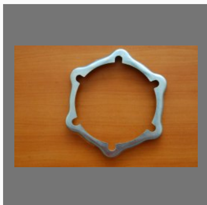
2000 AMP Clamp