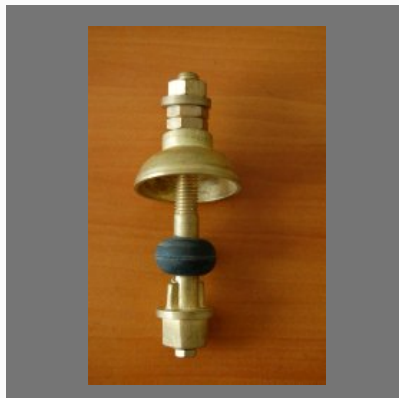
HV 250 AMP Metal Part