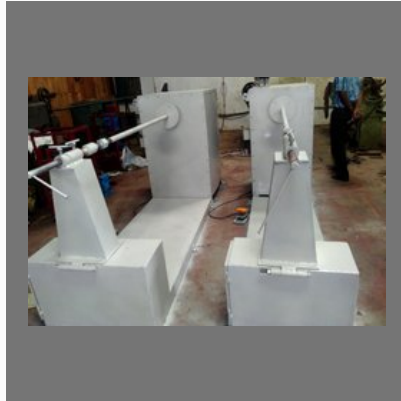
Coil Winding Machine.