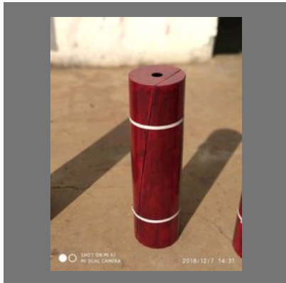
Transformer Coil Winding Forma