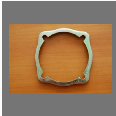
HV 250 AMP Clamp