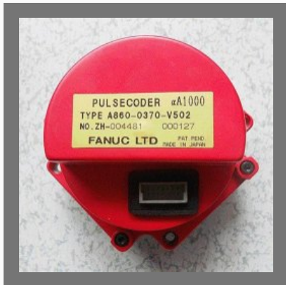
CNC Fanuc Pulsecoders