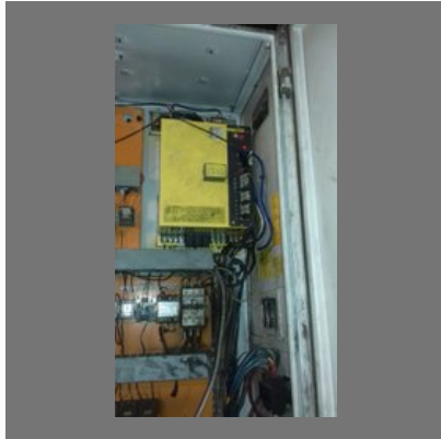
Cnc Retrofitting Services