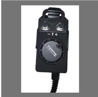
MPG Handwheel Magnetic Pendant