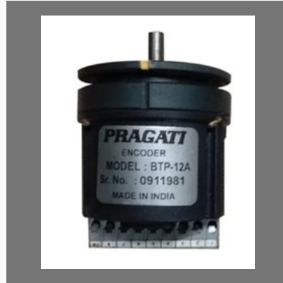
Pragati Turret Encoder