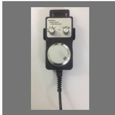
3 Axis Cnc Controller