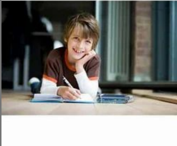
Children Education Plan