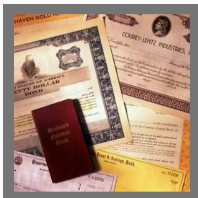
Bonds Investment Services