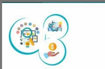
Business Advisory Services