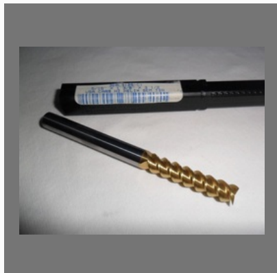
Solid Carbide Cutting Tool