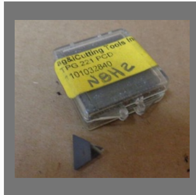
Polycrystalline Diamond Insert