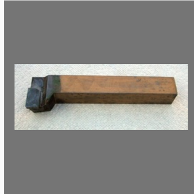
Lathe Cutting Tool