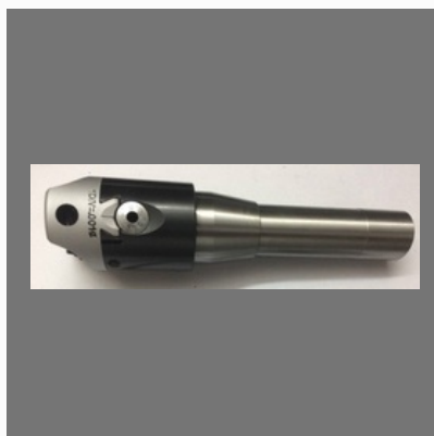
Shank Boring Thread