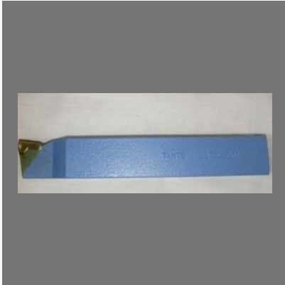
Brazed Carbide Tool