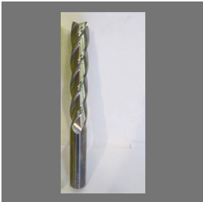
Morse Cutting Tool