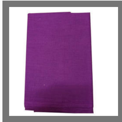
Rubia Plain Cotton Fabric