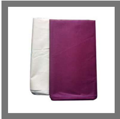
Rubia Plain Fabric