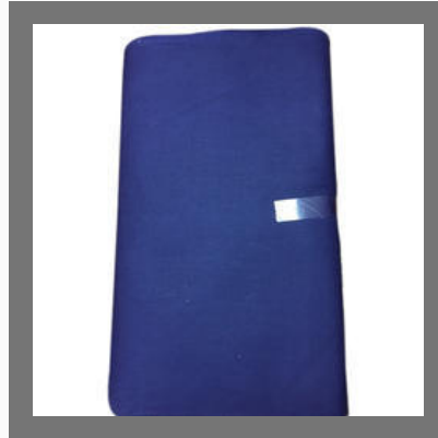
Plain Cotton Poplin Fabric