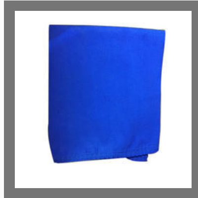
Fashion Cotton Plain Petticoat