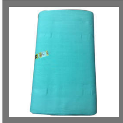
Cotton Poplin Plain Fabric