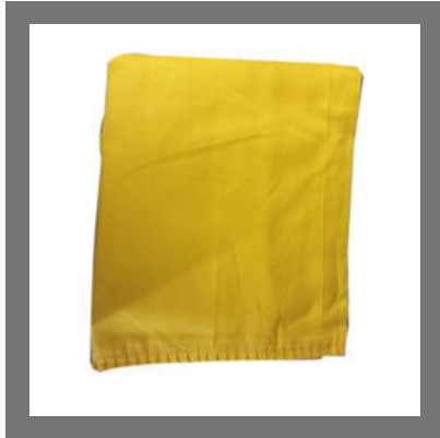
Fancy Cotton Plain Petticoat