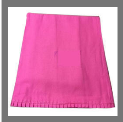
Frilled Ladies Plain Cotton Petticoat