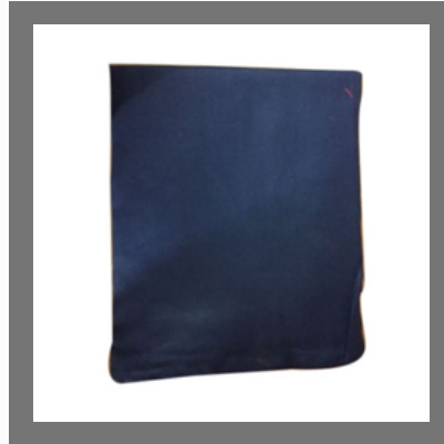
Designer Plain Cotton Petticoat