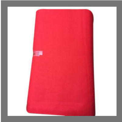
Red Cotton Poplin Plain Fabric