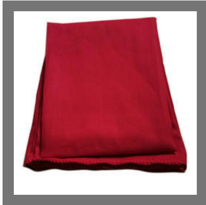
Ladies Plain Cotton Petticoat