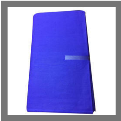
Blue Plain Cotton Fabric