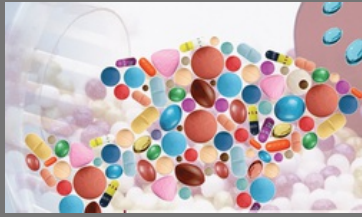
C & F Agents