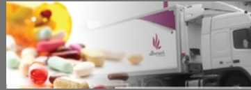
Direct To Patient Hospital