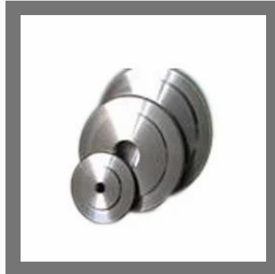
Flat Grinding Wheel