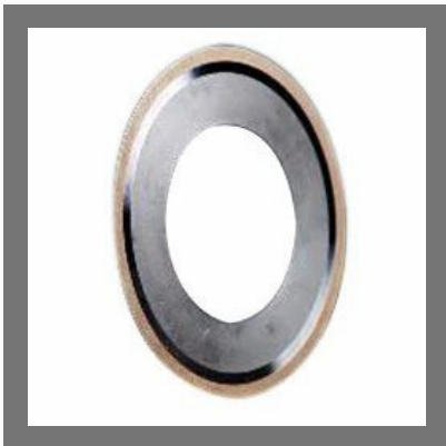
High-Precision Ultra Thin Cutting Blade