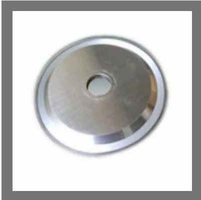
Resin Diamond Bond & CBN Grinding Wheel