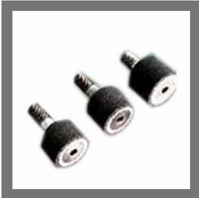
Bearing Internal Grinding Tools