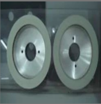
Bonded Diamond Wheel