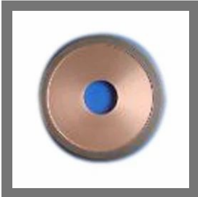
Single Bevel Edge Grinding Wheel