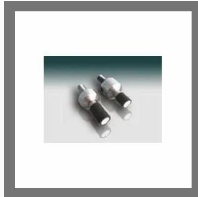
Compressor Cylinder Grinding Wheel