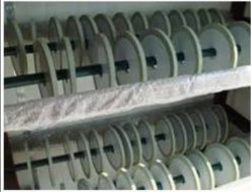
Vitrified Bond Diamond Wheel