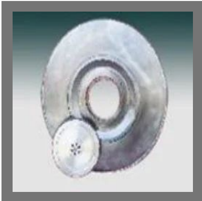
Crankshaft Grinding Wheel