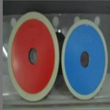
Grinding Stones Bonded Diamond Wheel