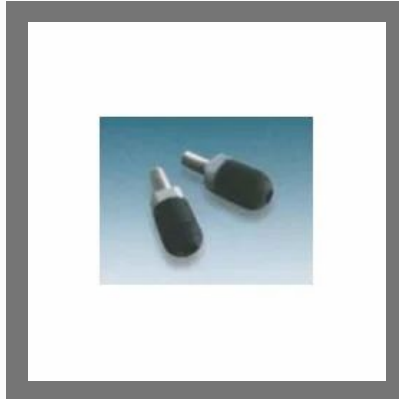
Joint Grinding Ball Rod