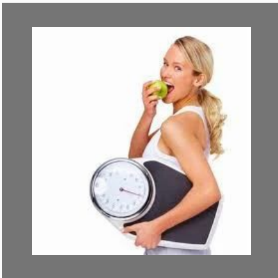
Weight Loss Services