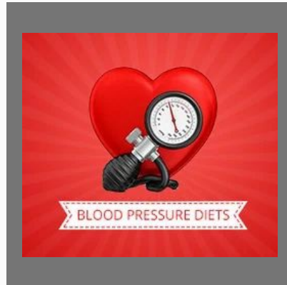
Blood Pressure Diets Treatment Service