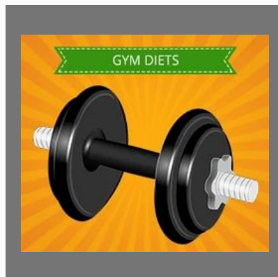
Gym Diets Treatment Service