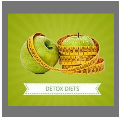
Detox Diets Treatment Service