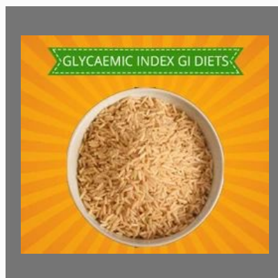
Glycaemic Index GI Diets Treatment Service