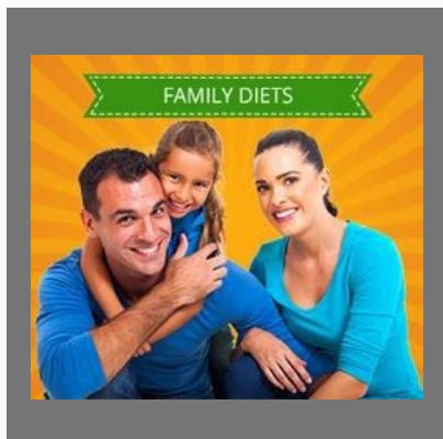
Family Diets Treatment Service