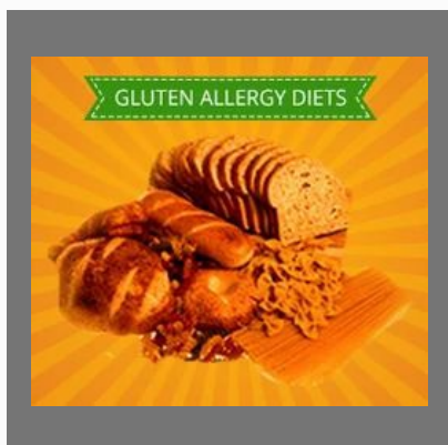
Gluten Allergy Diets Treatment Service