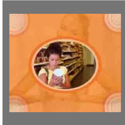
High Cholesterol Diet Programs