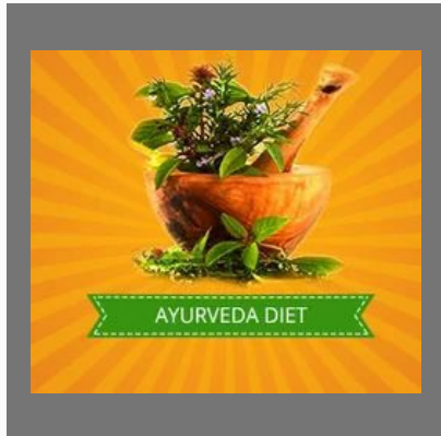
Ayurveda Diet Treatment Service