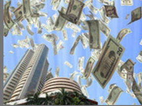
Equity Future Pack Service