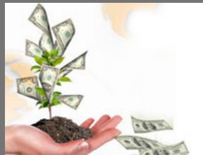
Nifty Future Pack Service