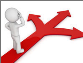
Equity Options Service