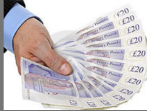
Equity Premium Service