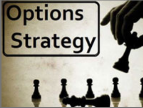
Nifty Options Service