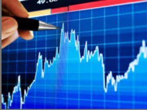
Equity Market Service