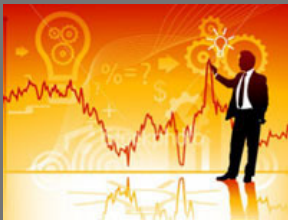
Nifty Premium Pack Service