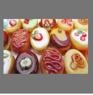
Fruit Crushe Chocolates