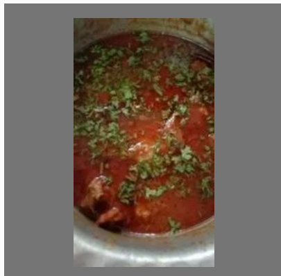
Fresh Butter Chicken