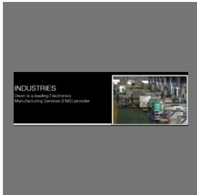
Plastic Injection Moulding