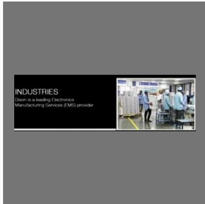
Consumer Electronics Products