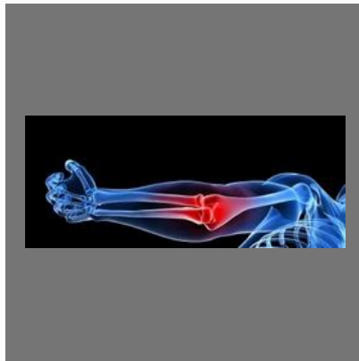
Rheumatology & Joint Pain Treatment Services