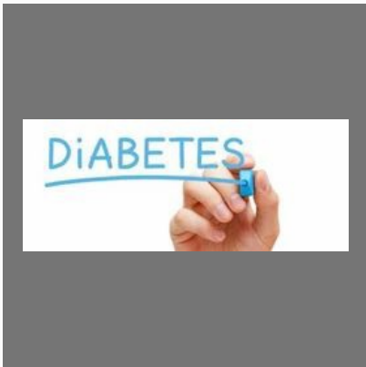
Diabetology Treatment Services