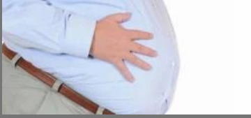
Obesity Treatment Services