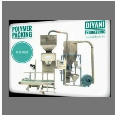
Bag Filling Automation Machine