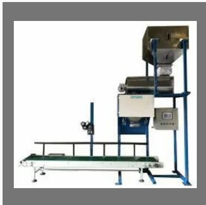
Chemical Powder Bag Filling Machine