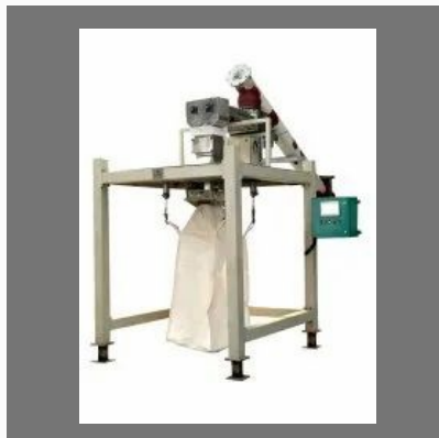
Jumbo Bagging Machine