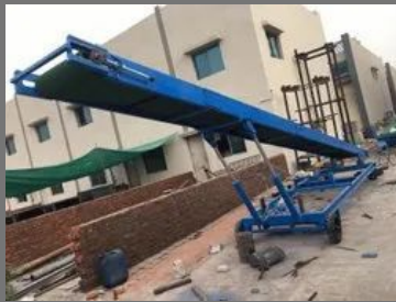
Truck Loading conveyor