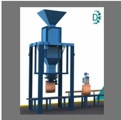
Fertilizer Bagging System