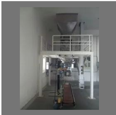
Bag Filling Machine With Stitching And Conveying