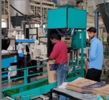
Bag Filling Machine With Stitching And Conveying