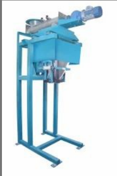
Guar Gum Powder Packing Machine