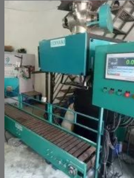
Dry Onion Kibbled Packing Machine