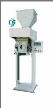
Rice Packaging machine