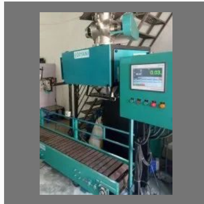
White Cement Packing Machine