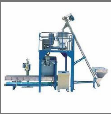
Bag Filling Machine