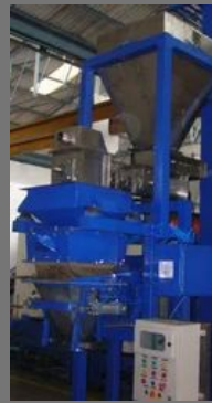
Bagging Filling Machine