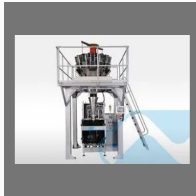
Weighmetric Bag Filling System