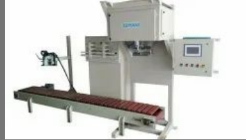
25 Kg Bag Filling And Hot Sealing Machine