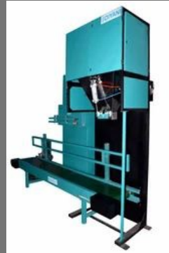
Bag Packaging Machine