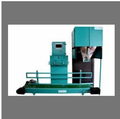
Rice Filling System