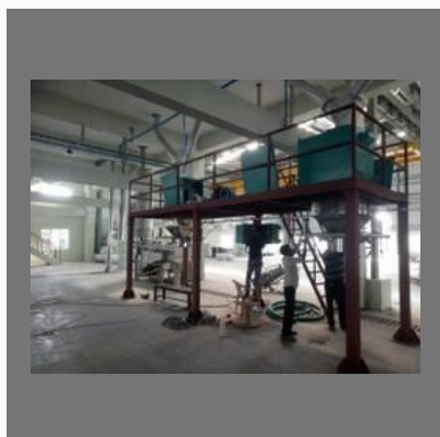
Jumbo Bagging System