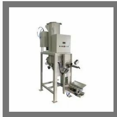
Silica Sand Bag Filling Machine