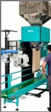
20 TPH Bagging Machine Systems