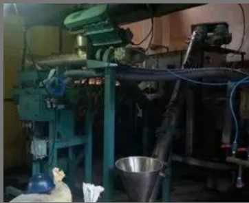
Soap Stone Powder Packing Machine