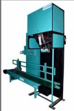
Grain Seed Bag Packing Machine