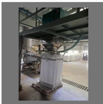
Big Bag Filling System