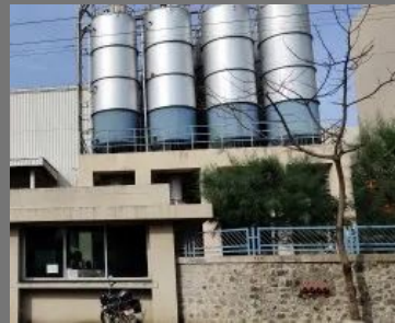
Water Soluble Fertilizer Packing Machine