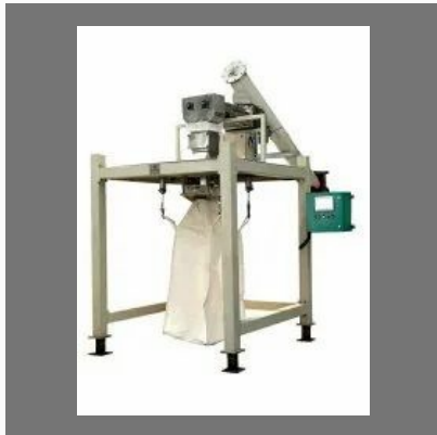
Bulk Bagging Systems