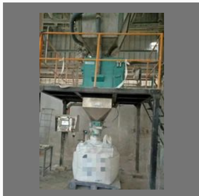
Jumbo Bagging System