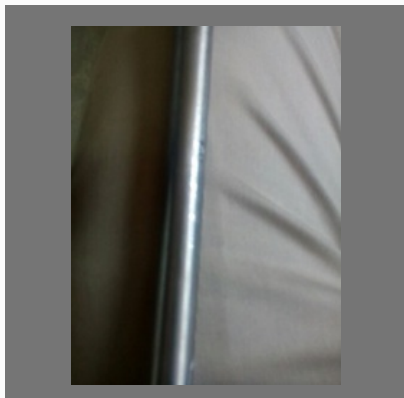
Hydraulic Pneumatic Parts