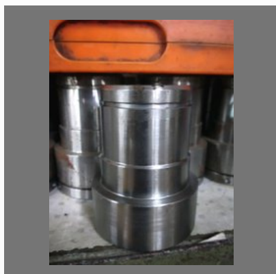
Front End Cover