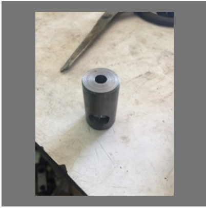
Pneumatic System Cylinder Spare