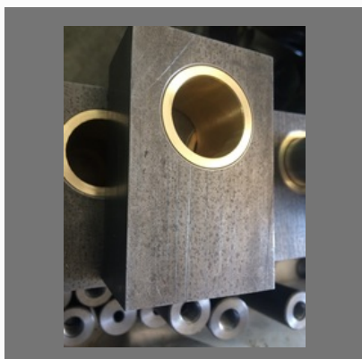
Double-acting Air Cylinder