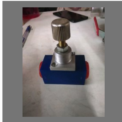
Flow Control Valve