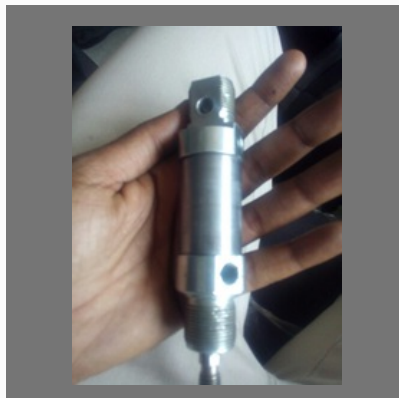
Hydraulic Pump Part