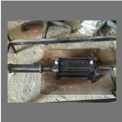
Pneumatic Cylinder Assembly