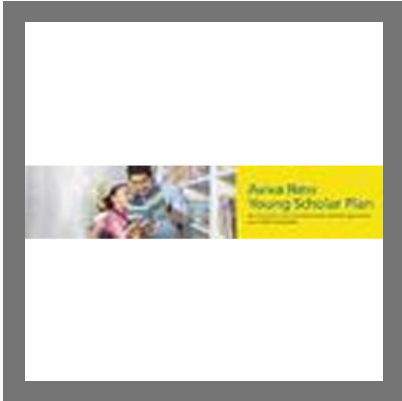
Financial Child Plan