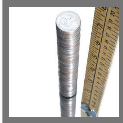
Corporate And Fixed Deposits