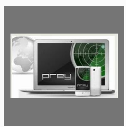
Laptop Tracking System