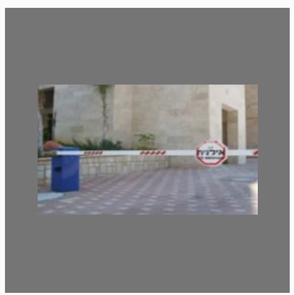
Electric Arm Barrier