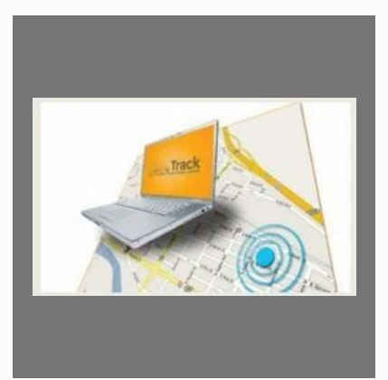
Access Control System