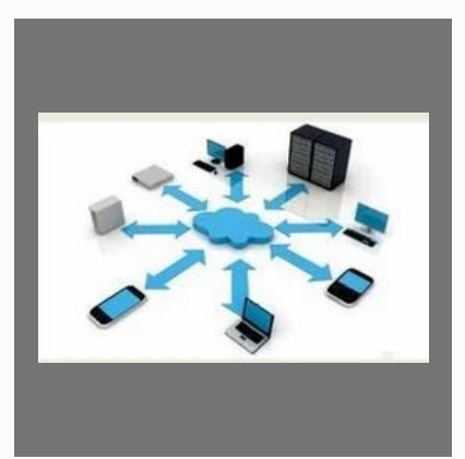
Asset Tracking System