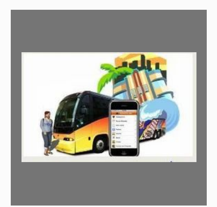
Mobile Tour Management