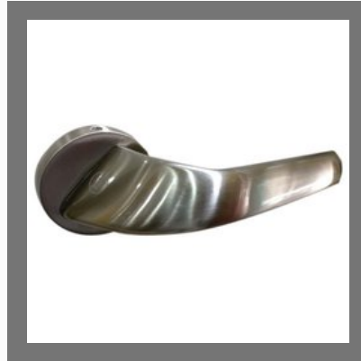
SS Door Handle