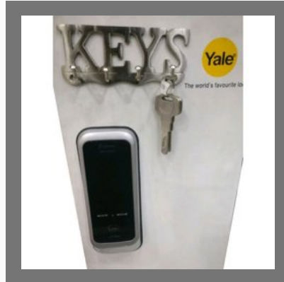
Smart Door Lock