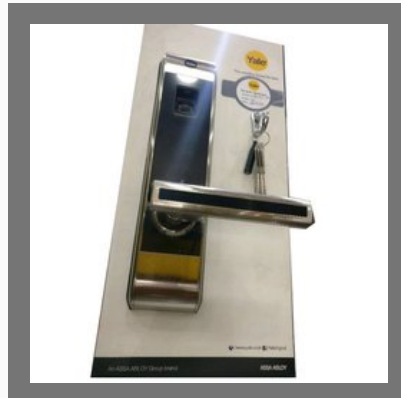
Yake Biometric Door Lock