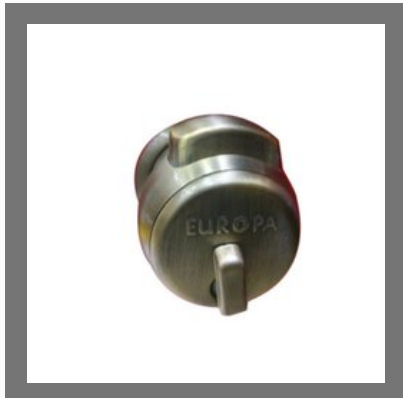
Modular Door Lock