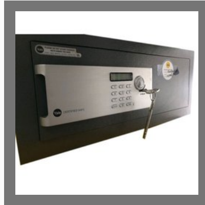
Safe Digital Lock