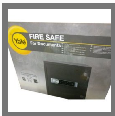
Fire Safety Locker