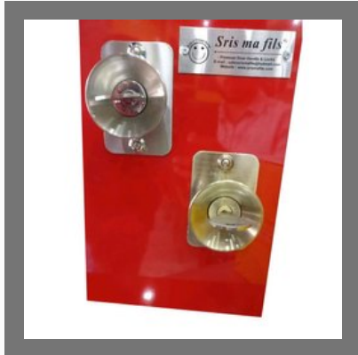
Sisma Door Locks