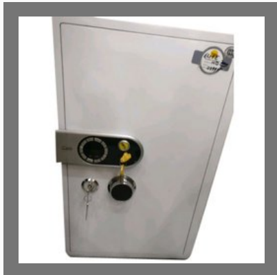
Heavy Duty Digital Safe Lock