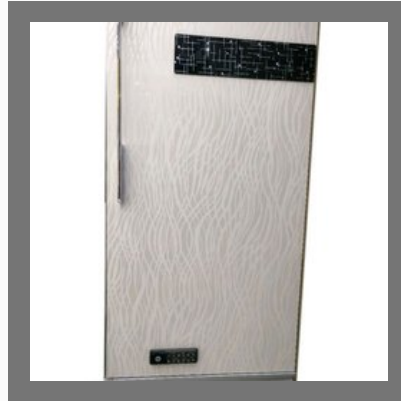
Yale Wardrobe Digital Lock