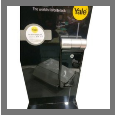
Yale MS Digital Lock