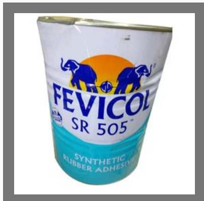
Fevicol Synthetic Rubber Adhesive