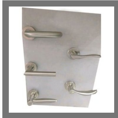
Kich Door Handle