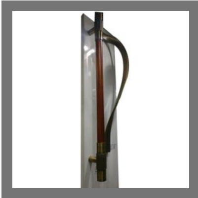
Premium Door Handle