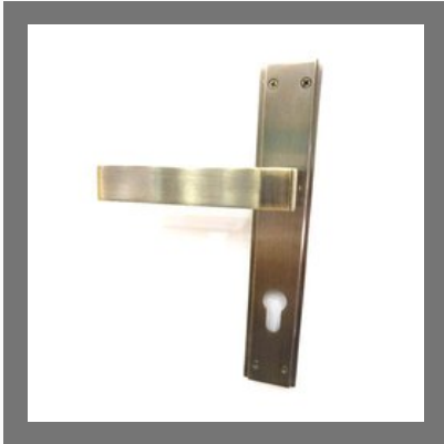
SS Lock Door Handle