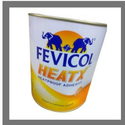
Heatx Waterproof Fevicol Adhesive