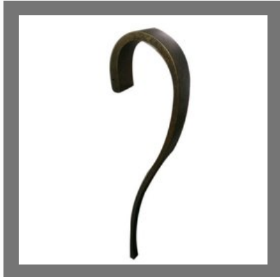
SS Main Door Handle