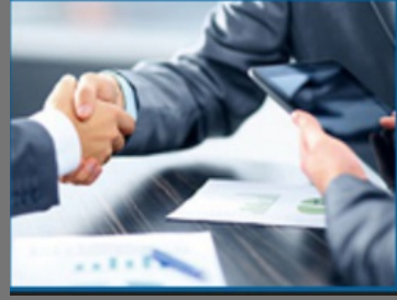
Vat Consulting Services