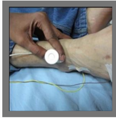
NCS And RNS Test