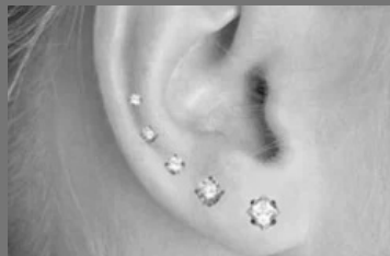
Ear Piercing Treatment Service