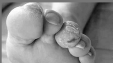
Diabetic Foot Care Treatment Service