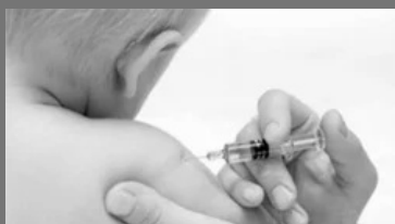
Vaccination Treatment Service