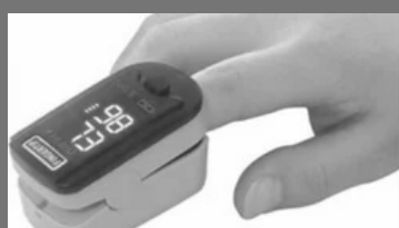
Pulse Oxymeter Treatment Service