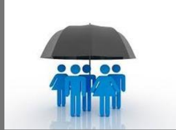
Group Term Life Insurance