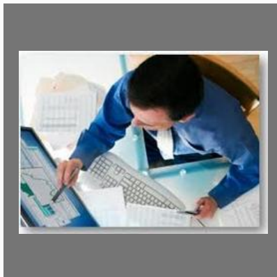
Public / General Liability