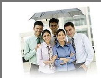
Group Superannuation Insurance