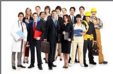
Group Health Insurance