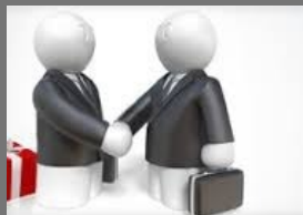
Office Package Insurance