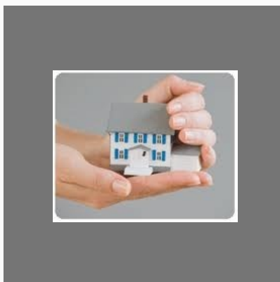
Property All Risks Insurance