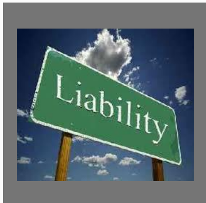
D & O Liability Insurance