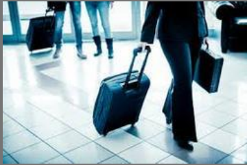
Corporate Travel Insurance