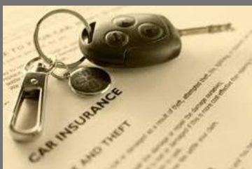
Car Fleet Program Insurance