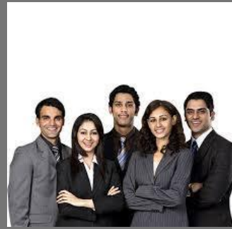
Group Gratuity Insurance