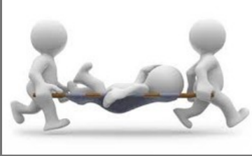
Group Personal Accident Insurance