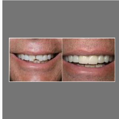
Dental Cosmetic Surgery