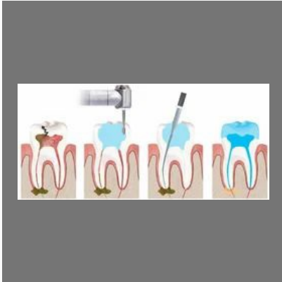
Root Canal Treatment (R.C.T.)