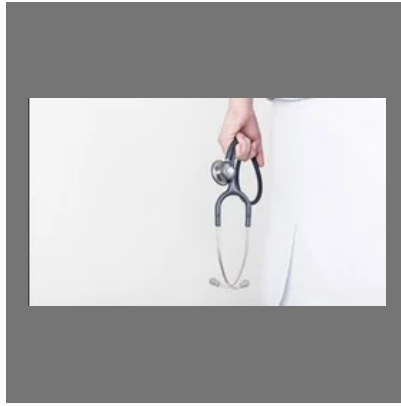
Phlebotomy Technician Course