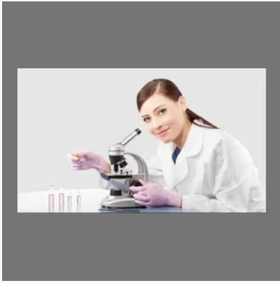
Medical Laboratory Technology Course