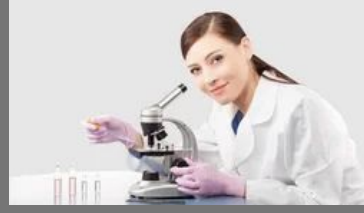
Gynecology Treatment Service