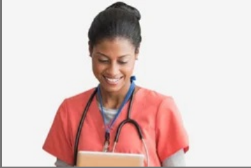
Hematology Treatment Service