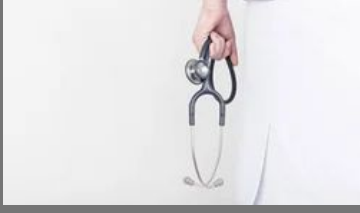
Endocrinology Treatment Service