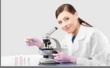
Endocrinology Treatment Service