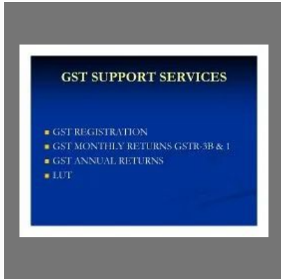
GST Return Filing