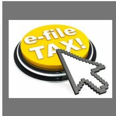
Income Tax Return Filing