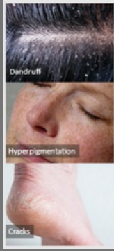
Skin Problems Treatment Service