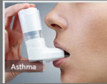
Asthma Treatment Service