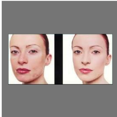
Vitiligo Treatment Services